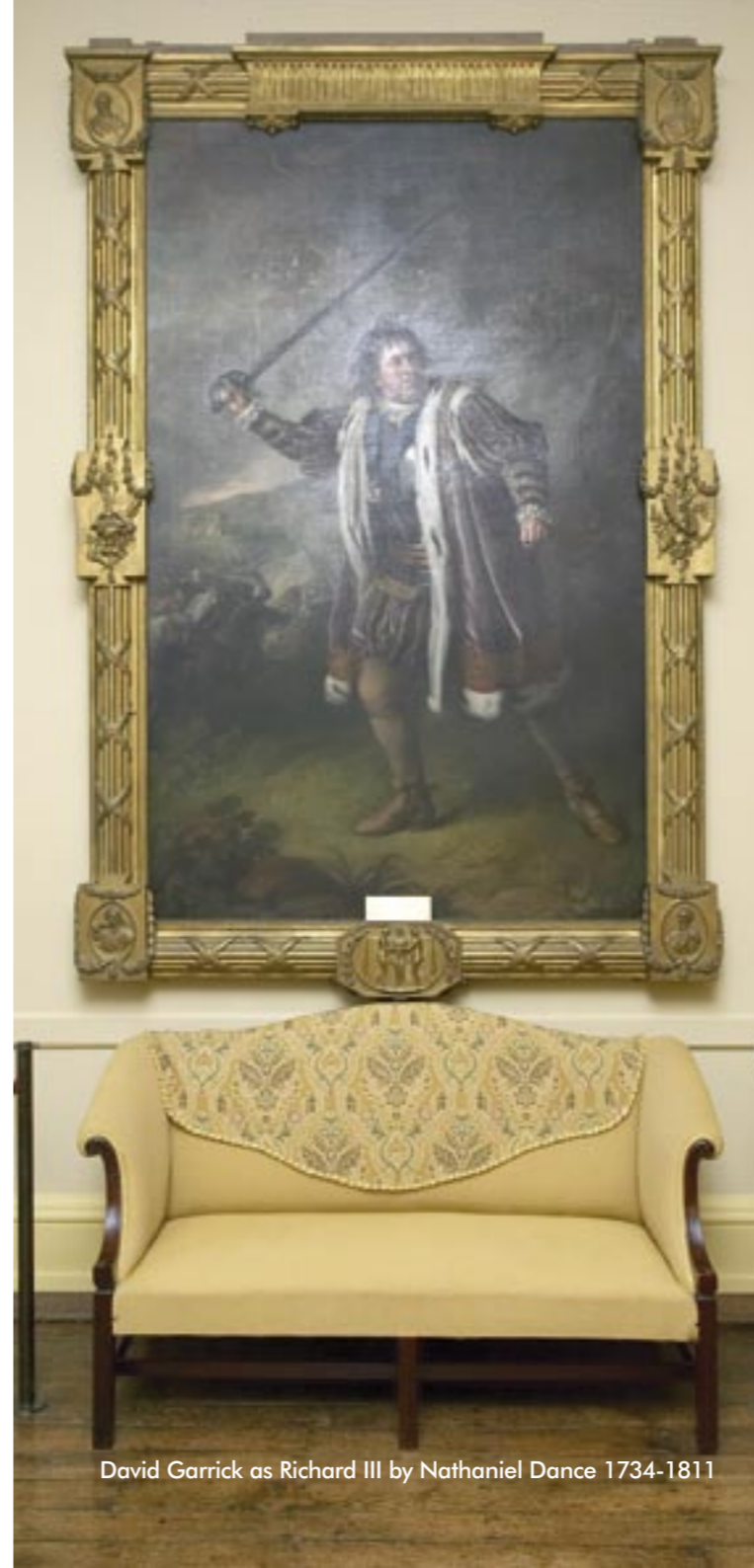
David Garrick as Richard III by Nathaniel Dance 1734-1811

The auspicious ballroom and anteroom boasts beautiful proportions with interesting candelabra, exquisite chandeliers and fine art. The anteroom has a Canadian Maple floor with a subtle patina and the ballroom has arguably one of the best sprung dance floors in the Midlands.